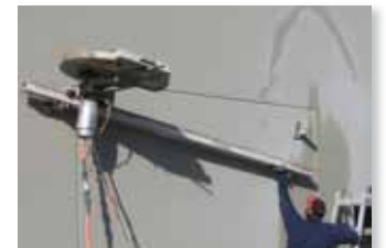
Versatile track system