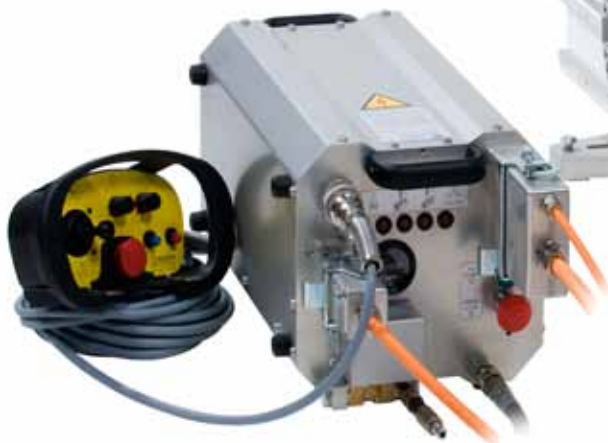
Pentpak 427 HF-power pack with Pentrunder autofeed system