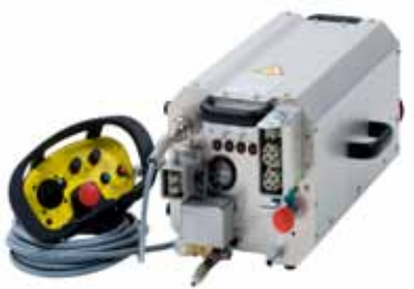
Pentpak 427 HF-power pack with Pentrunder autofeed system