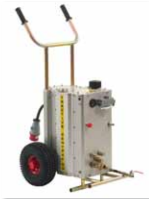
Pentpak hydraulic power pack