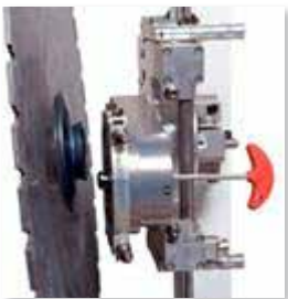
Quick disconnect coupling for blade