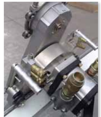
Versatile track system